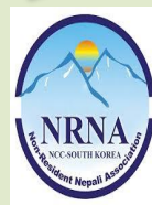
Non-Residential Nepali Association (NRNA) South Korea (Partner)