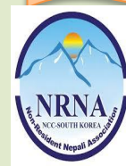
Non-Residential Nepali Association (NRNA) South Korea (Partner)